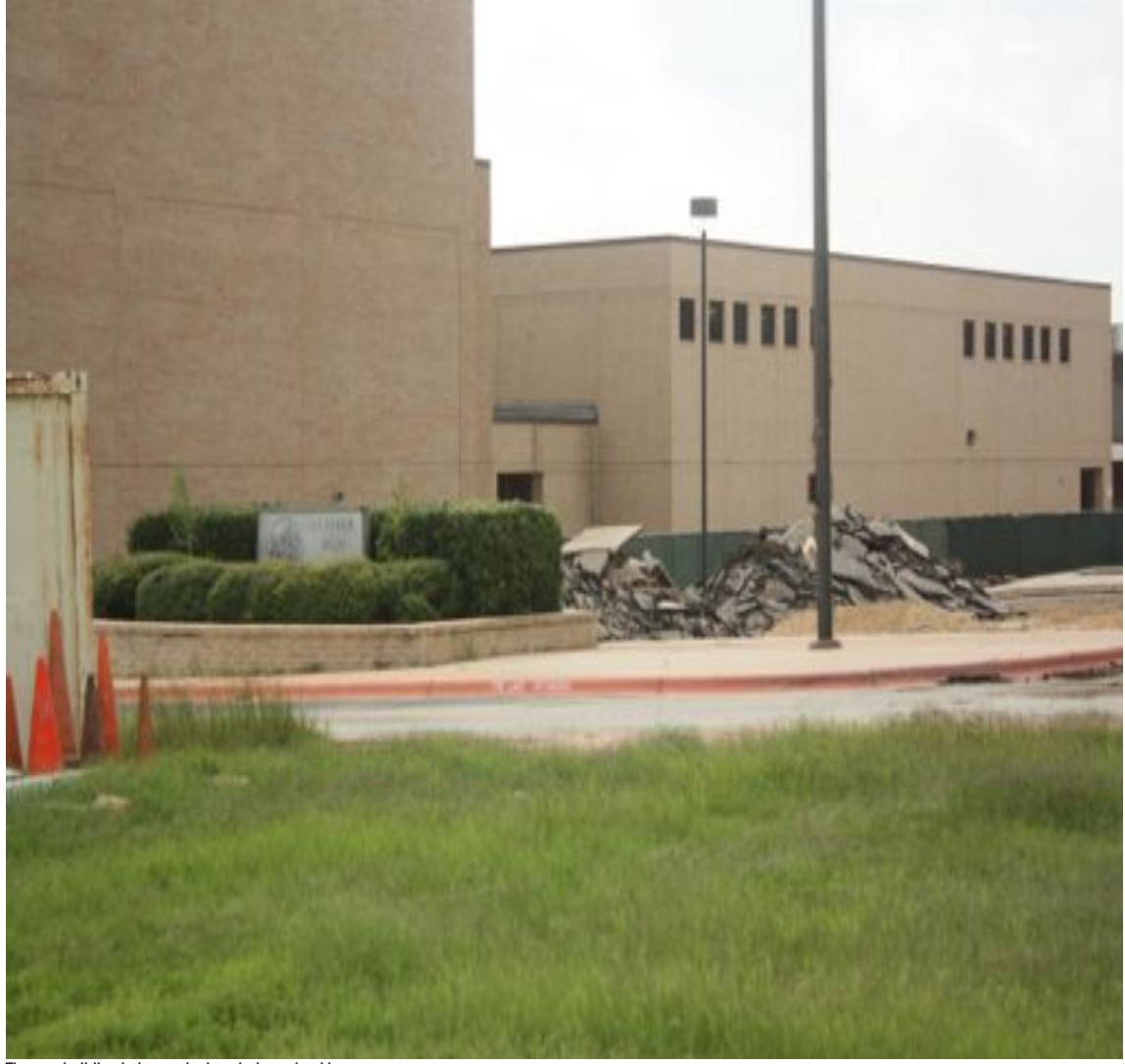
The new building being worked on during school hours

What was planned for traffic flow due to construction